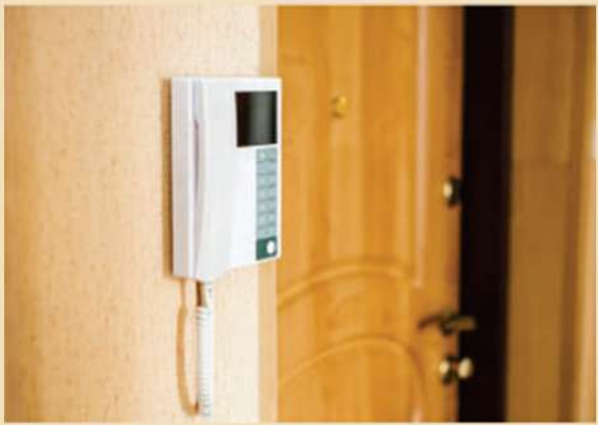
VIDEO DOOR PHONE