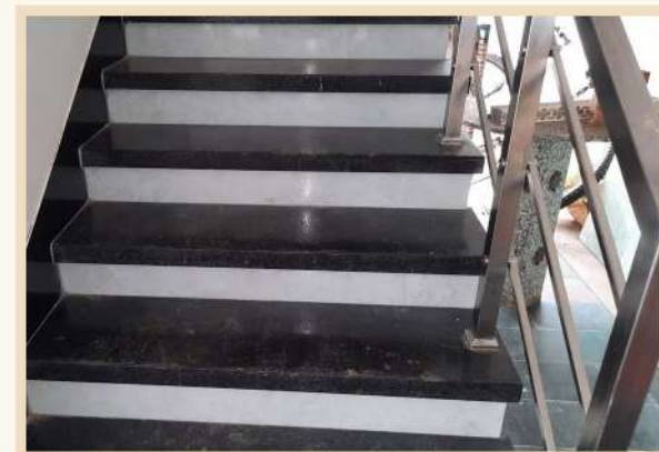
GRANITE STEPS WITH SS HANDRAIL