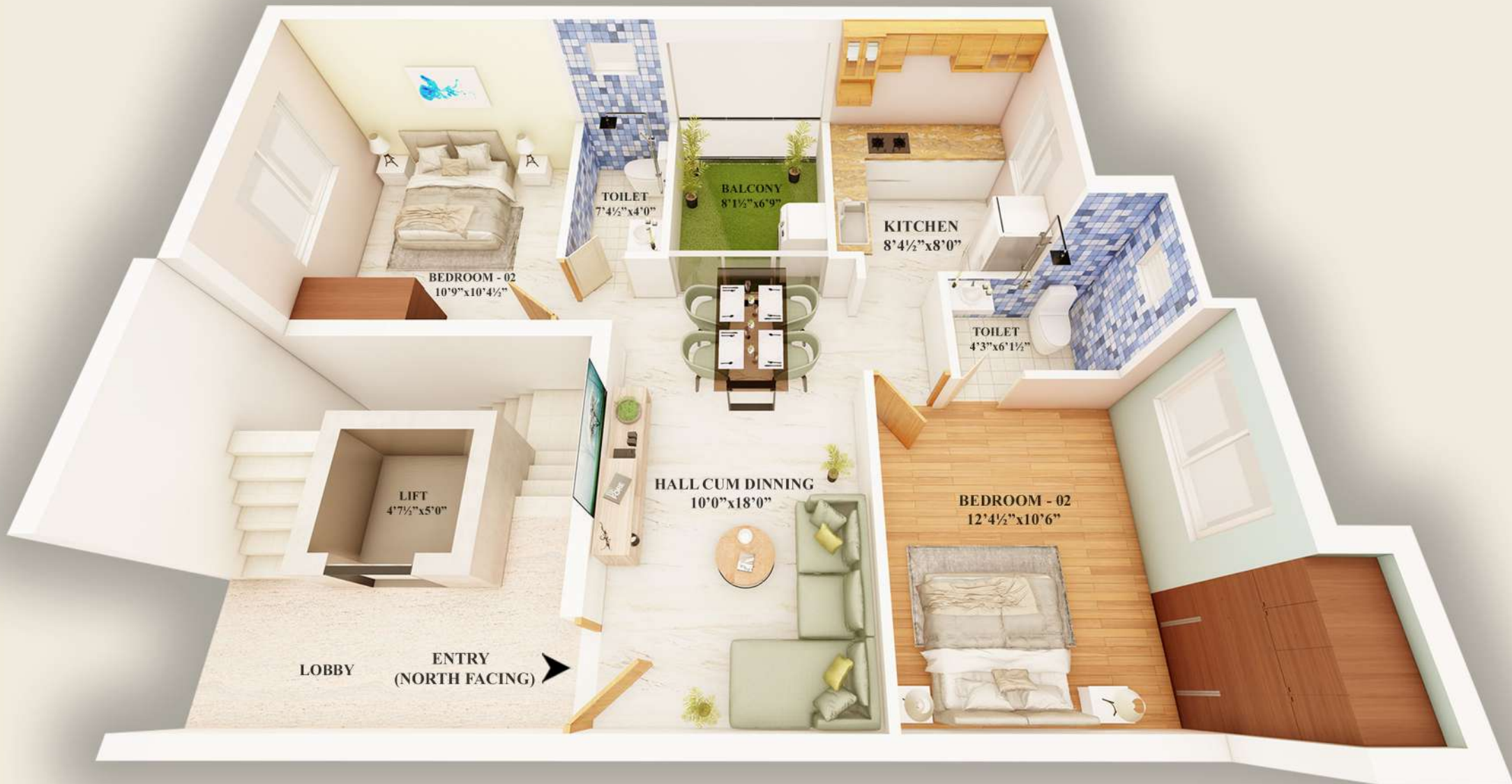
3D VIEW FOR FLAT - F1, S1& T1