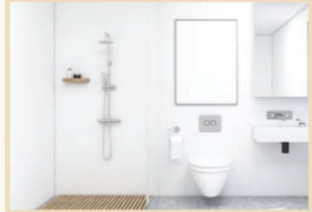
COMMON WASH ROOM