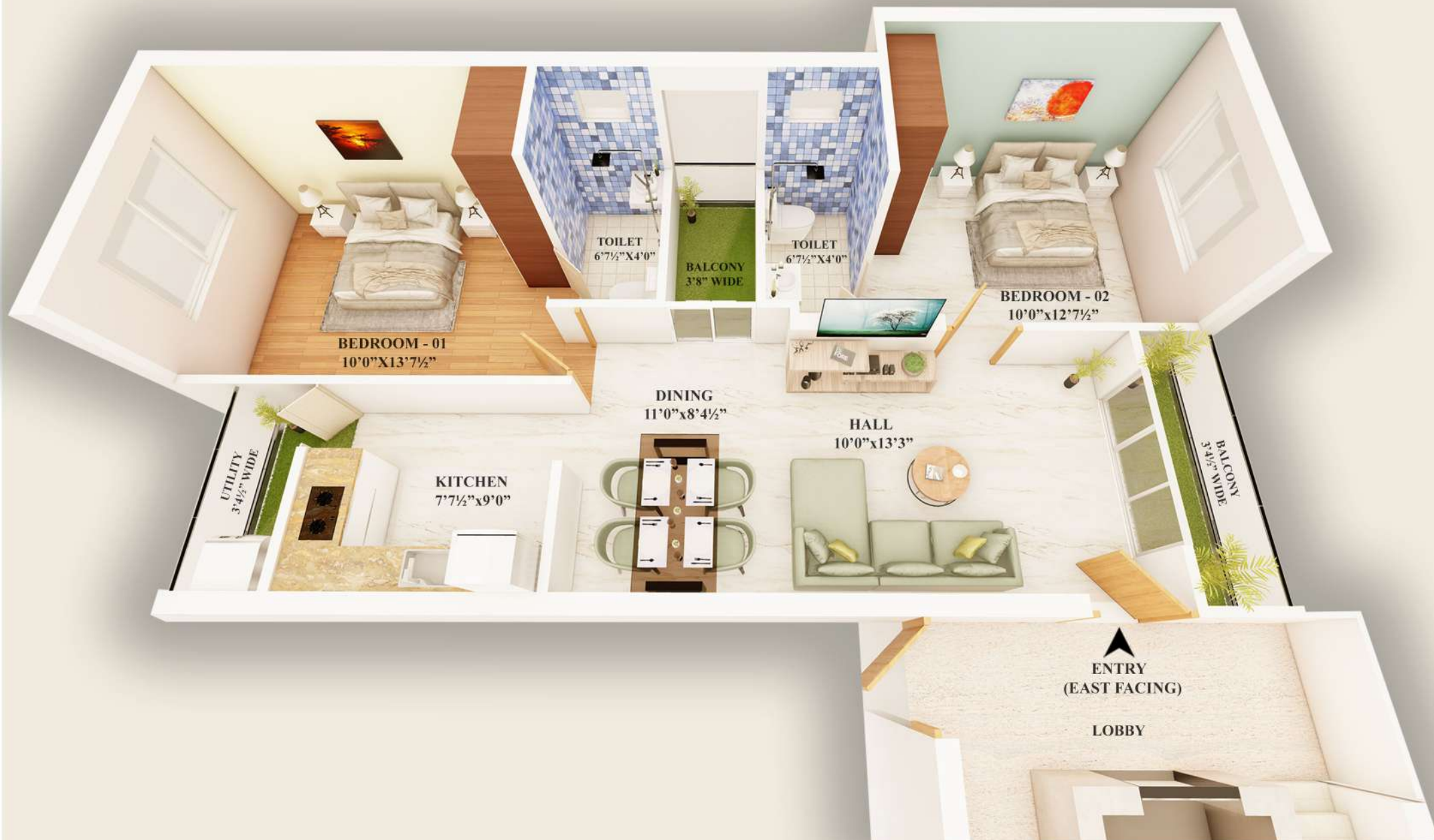
3D VIEW FOR FLAT - F2, S2& T2