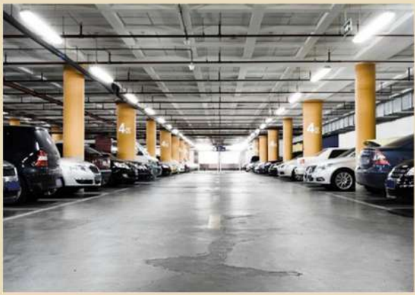
COVERED CAR PARKING