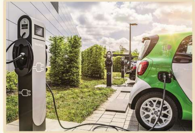
EV CHARGING POINT